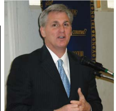
Congressman Kevin McCarthy

The speaker today was Congressman Kevin McCarthy. He mostly dealt with the solutions for the current financial crisis. He stated that the tax increases of 1930 and 1931 didn't bring us out of the depression, that they actually made the depression worse. He advocates lower tax rates for small businesses because 70% of all new jobs come from small businesses. He also advocates energy independence so that we won't continue to support people like Hugo Chavez with our oil money.