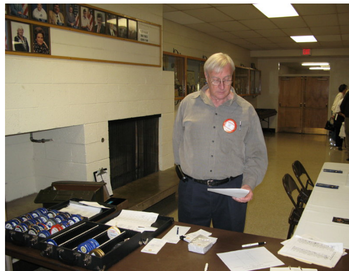
He's checking it twice !!!! (if you haven't signed his roster, God help u)