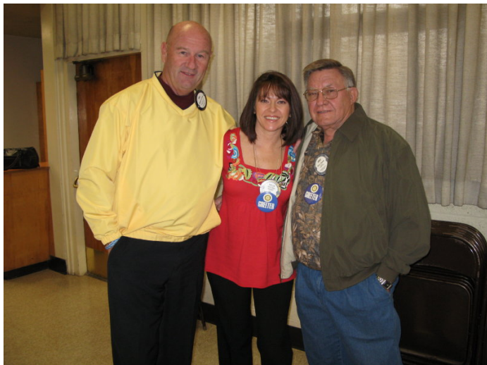
BERC greeters !!!