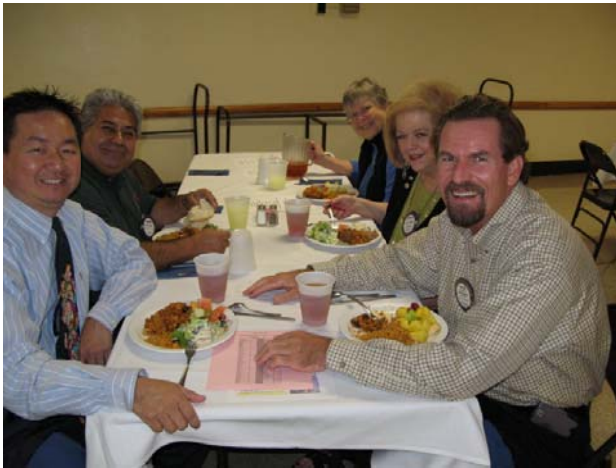
Fun Pictures of Fun People at a Fun Meeting