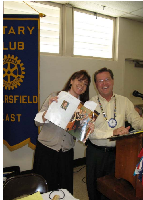
Our Fun President getting FINED !!!!