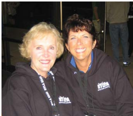
Two tired but happy counselors!!

No one needed to announce that the event was over. The music stopped, the table decorations got picked up and the purchases went home with the guests. All in all a good night was had up until 10:00.