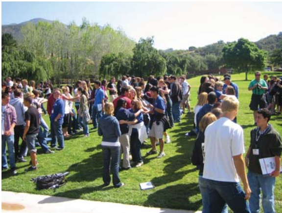
RYLA '09 participants