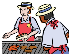
Bakersfield Rescue Mission Open House and Barbeque May 16, 2009 11:00 am to 1 p.m.