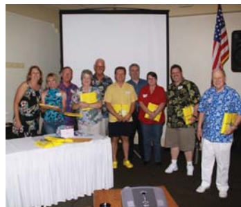
Thanks to the Board '08 - '09