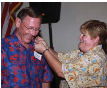
Out with the old and in with the new..